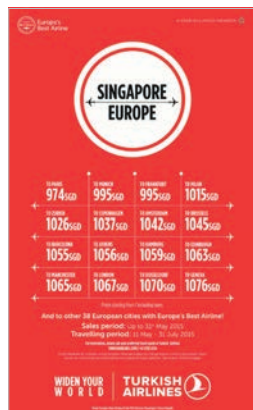
QUARTER PAGE (27cm x 3col)