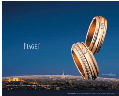
HALF PAGE (27cm x 6col)